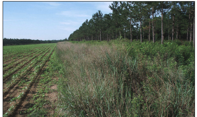
Borders of natural vegetation on field edges provide habitat for beneficial insects

Unfortunately, beneficial insects are susceptible to many pesticides. Use of insecticides can reduce beneficial insect populations, so choose and use these with care only as needed to control pest populations.