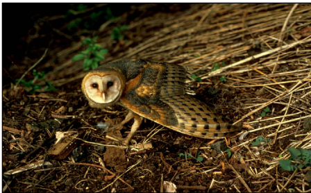
Barn Owl ( Tyto alba )

Birds of prey, such as hawks and owls, can be useful in controlling rodents and other small mammals. Among the many species of owls, the barn owl is the most helpful to farmers. A family of barn owls may consume more than 1,000 small mammals during a nesting season. Barn owls hunt at night and lay their eggs in hollow trees, crevices in cliffs, and holes in sandbanks. They also like to live in abandoned buildings, granaries or barns. They are fairly easy to attract by installing nest boxes.