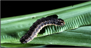
Fall Armyworm