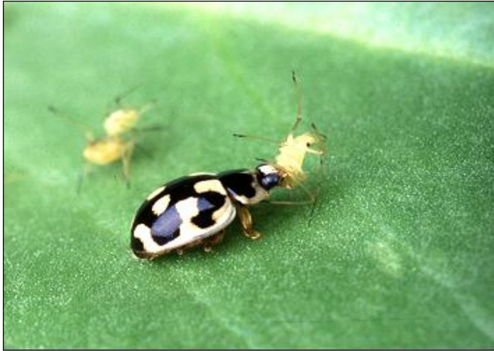
A lady beetle eating an aphid