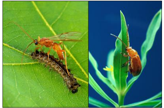
Wasp parasitizing a gypsy moth caterpillar Flea beetle feeding on leafy spurge