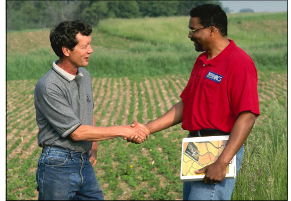
Helping People Help the Land

You may also be eligible to receive financial assistance, through a state or federal program. Your NRCS office will explain any programs that are available so you can make the best decision for your operation. All NRCS programs and services are voluntary.