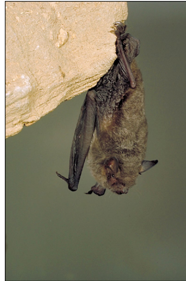
Gray Bat ( Myotis grisescens )

If enough birds live on your property, in addition to their help in managing pests, you may be able to generate income from birdwatchers and photographers willing to pay for the privilege of visiting your farm.