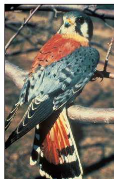
American Kestrel ( Falco sparverius )